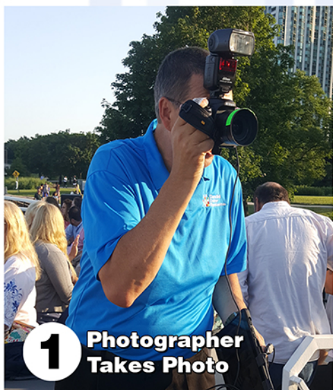
1 Photographer Takes Photo