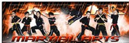
RAIN STORM 2