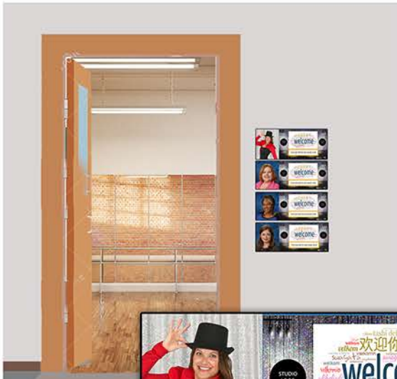
4"x 8" Door sign