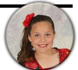
Moms love Photo Buttons