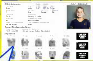
PHOTO ID AND FINGERPRINT CARD